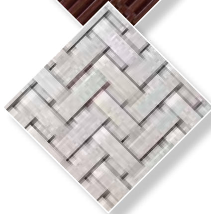
ABOVE: SKYWOODS NOW OFFERS WOOD WEAVING TO ADD A SPECIAL TOUCH TO CABINS

says Philippe Seidenbinder, CEO. "Our motto, 'What you imagine, we can create,' is an open invitation to all those aircraft owners who dream of beautiful woods and marquetry in the skies. Skywoods continues to push the boundaries of excellence, innovation and passion for wood, elevating aircraft interiors to new heights for new aircraft or for refurbishment projects." ✕